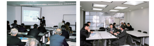
Fukuoka Venture Market's 'Monthly Market'