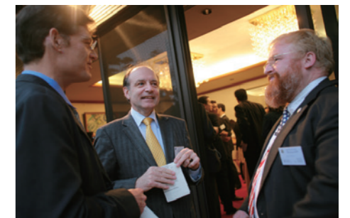
FIBA social events are held several times a year

Fukuoka International Business Association (FIBA) promotes business, academic and government ties between foreign organizations within Fukuoka Prefecture, as well as supporting Japanese companies interested in expanding business overseas. The association provides a forum where the latest business information and topics can be shared in a timely manner.