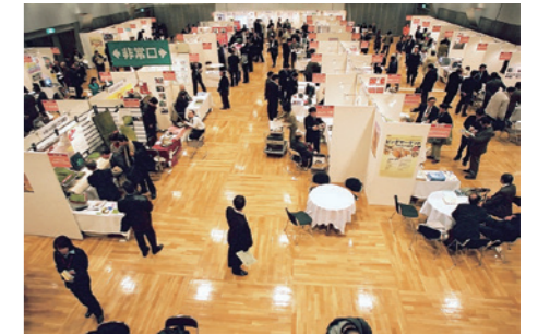
Fukuoka Venture Market's 'Big Market'