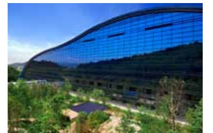
The National Museum in Dazaifu