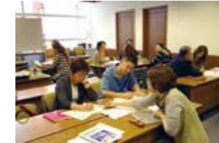
Japanese language class

A great network of cultural exchange activities