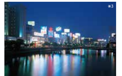
Downtown Fukuoka at night