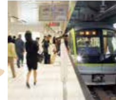
Fukuoka City Subway

Shortest commute time among major Japanese cities