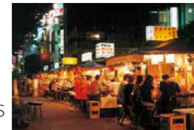
Street food stalls, locally known as 'Yatai'