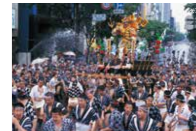
Yearly 'Yamakasa' festival in Fukuoka

Fifth highest number of parks among major Japanese cities* 2