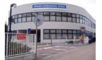
Fukuoka International School