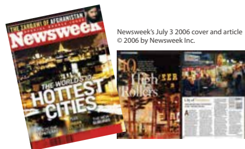
Newsweek's July 3 2006 cover and article

Fukuoka was ranked the 12th most livable city in the world by Monocle, an international lifestyle magazine based in London. The magazine portrayed Fukuoka as an international city with a friendly atmosphere. In particular it gave Fukuoka high marks for shopping and food.